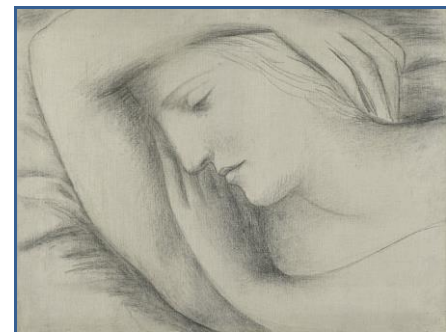
Pablo Picasso's Sleeping Woman