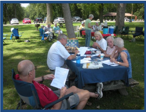
Ladies Who Care September Lunch at Wellington Herbs and Spices, Schoharie

Ladies Who Care sponsored a picnic for ladies and gents at the Henry Hudson Park on August 8 th . Eighteen were in attendance and despite a questionable weather forecast, the group managed to enjoy the event before a thunderstorm arrived. Musical trivia games engaged (and taxed) everyone's memories as lyrics from popular songs of the 50s - 70s were identified.